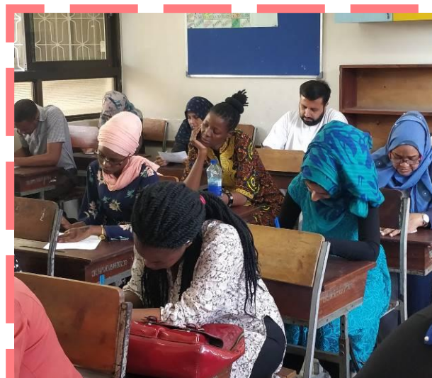
Teachers participate in both theory and practical learning sessions