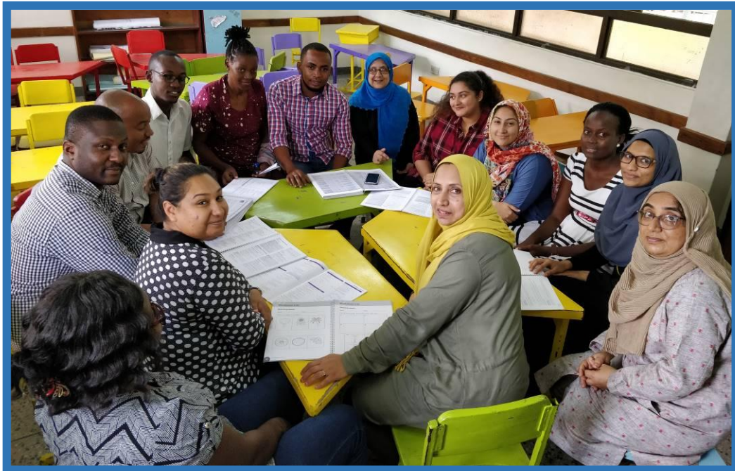
Teachers get together to discuss learning units and share ideas