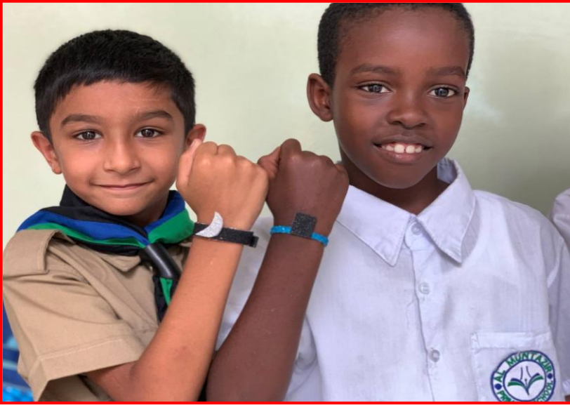
A Band-That embodies the friendship