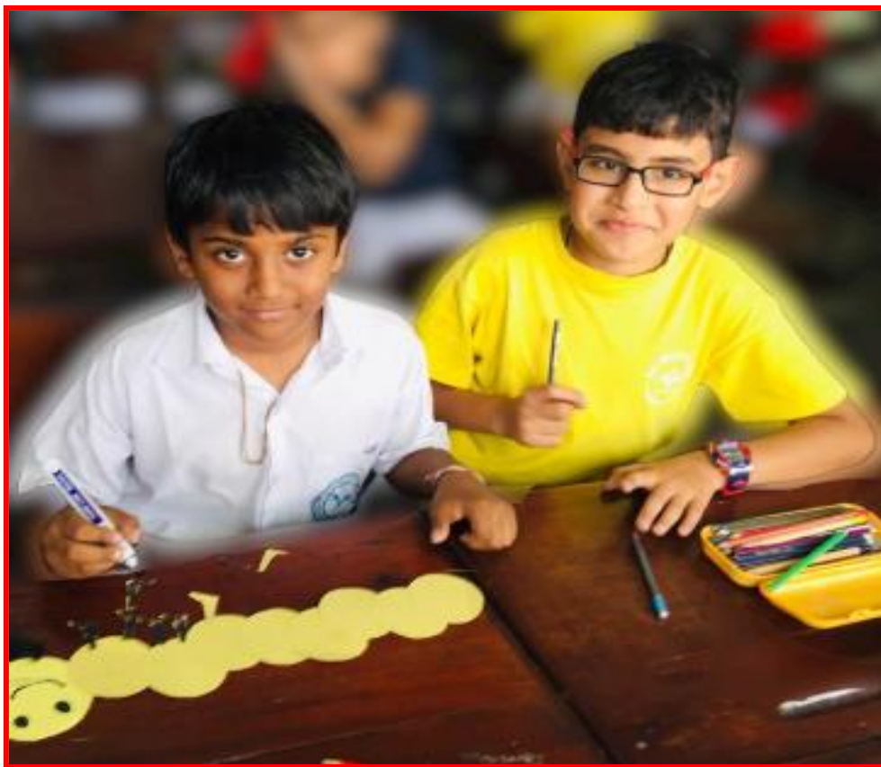
Happiness reflected on their faces as they spoke about friendship