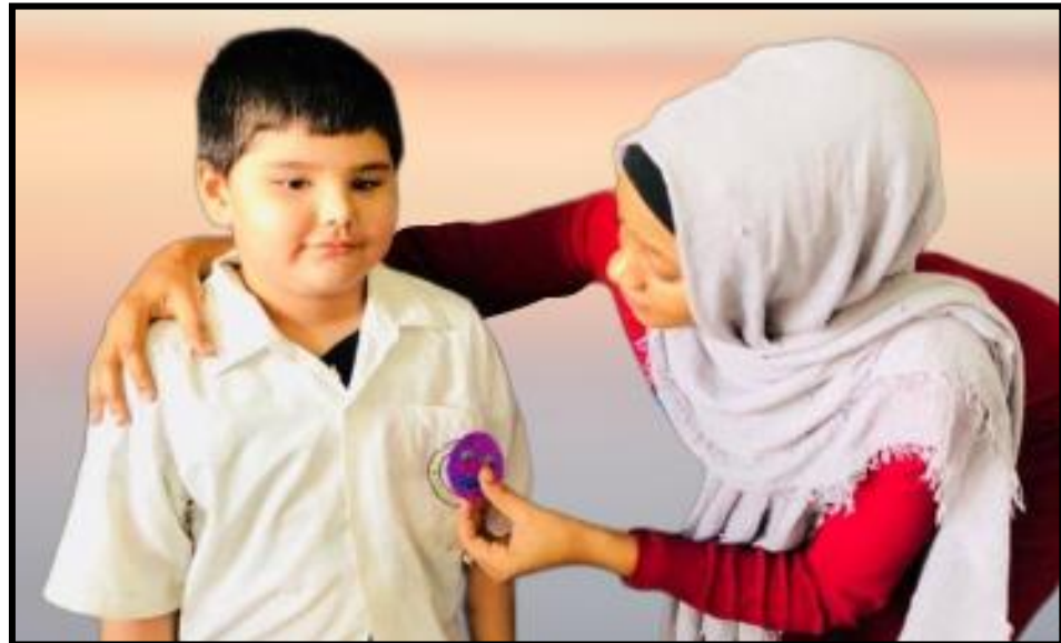
Friendship Badge - symbol of trust