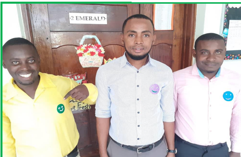
Staff Memebers – Precious Friendship