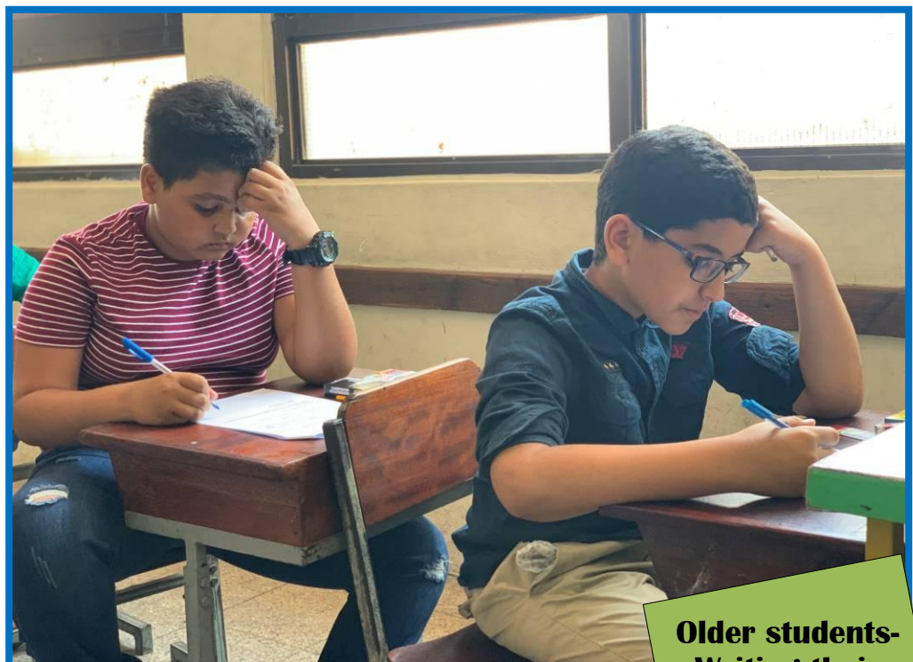
Older students- Writing their exam

The students spent half of their day in the class which allowed them to get a feel of the school's environment. During this child-friendly evaluation, children got the opportunity to make new friends, play out and work in a less pressured environment. Besides a written assessment for English and Mathematics, students were also involved in different activities where our team of teachers assessed their social, emotional, and cognitive skills.